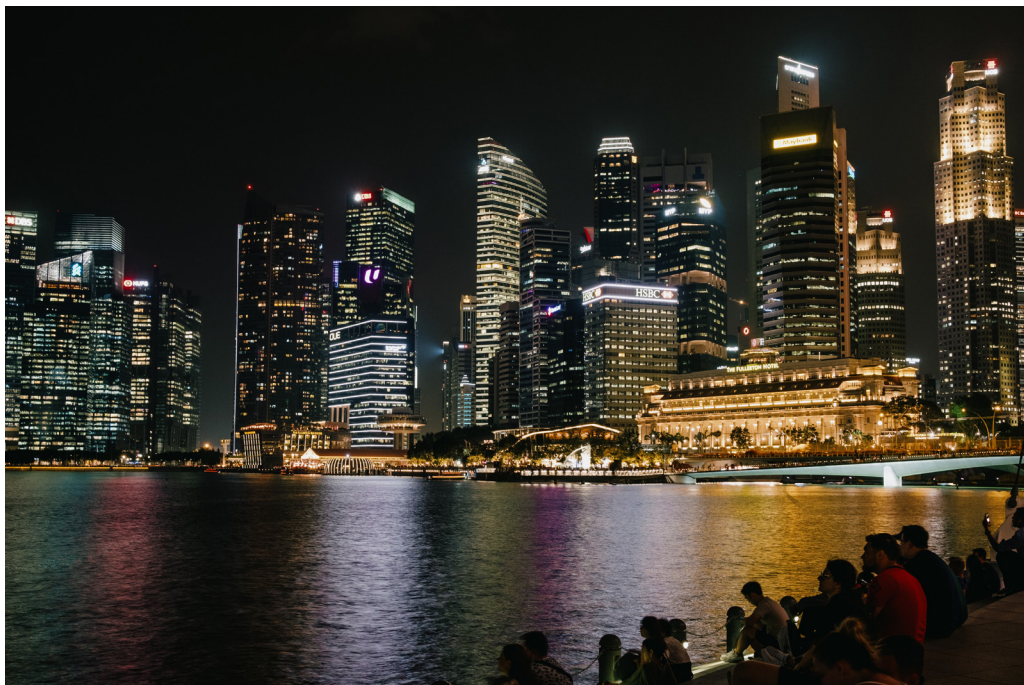
Singapore skyline at night at Marina Bay.

Over the next week, we were rewarded with unforgettable sights, sounds, and tastes as we explored this fascinating nation in the Pacific. Part of that, of course, was experiencing the culture, and various aspects of a nation's daily life. Our mission-related experience, it turned out, was every bit as rich, and in fact the two kinds of experiences merged more often than not. We visited a playground where young children and older adults play together on see-saws and merry-go-rounds, both designed to meet each group's different needs. We met with older individuals who told us about their lives as we ate the delicious lotus paste-filled mooncakes they served us.