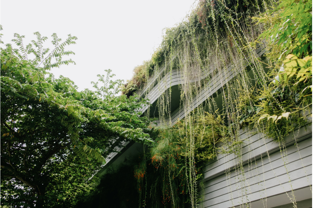
HDB flats have integrated foliage and greenery as part of efforts to create a livable and sustainable environment for residents.

areas as wellness, employment, housing, retirement security, education, social inclusion, and vulnerable older adults.