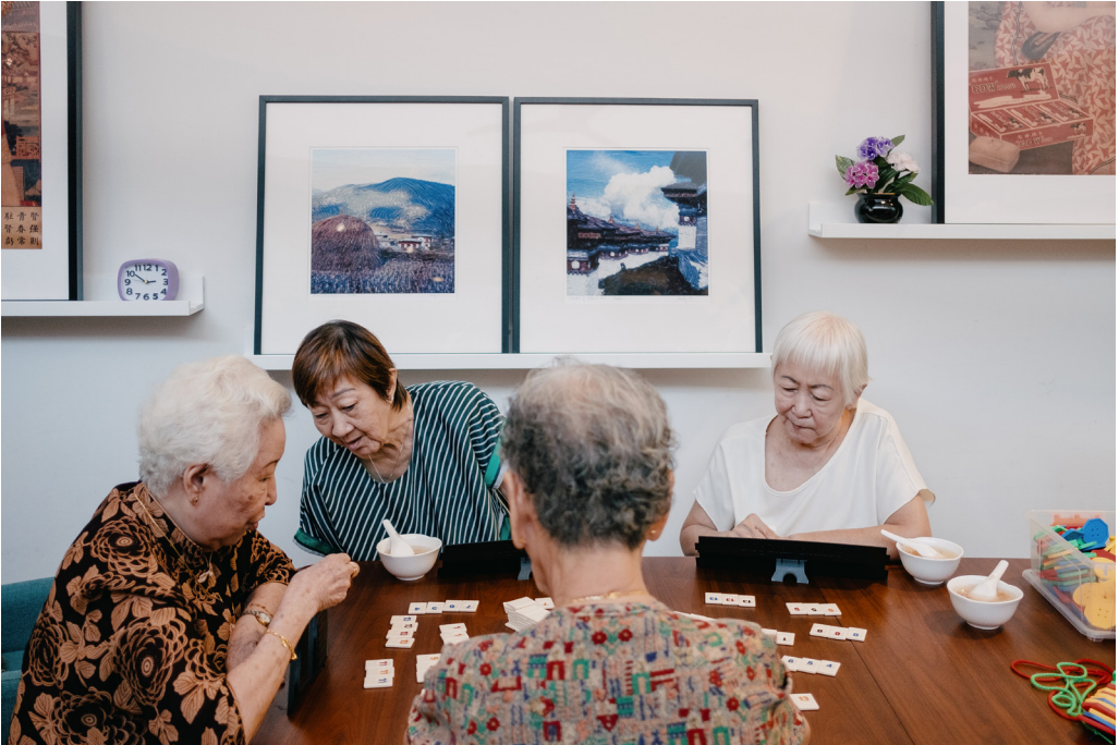
Friends gather for a friendly game of Rummikub at the Whampoa centre.

as both a gift of time and an opportunity. Embracing policies that promote independence, engagement, and inclusion, he explained, can create a movement in which Singaporeans “live to learn and learn to live.” Public-private partnerships are moving the nation closer to that goal, he said.