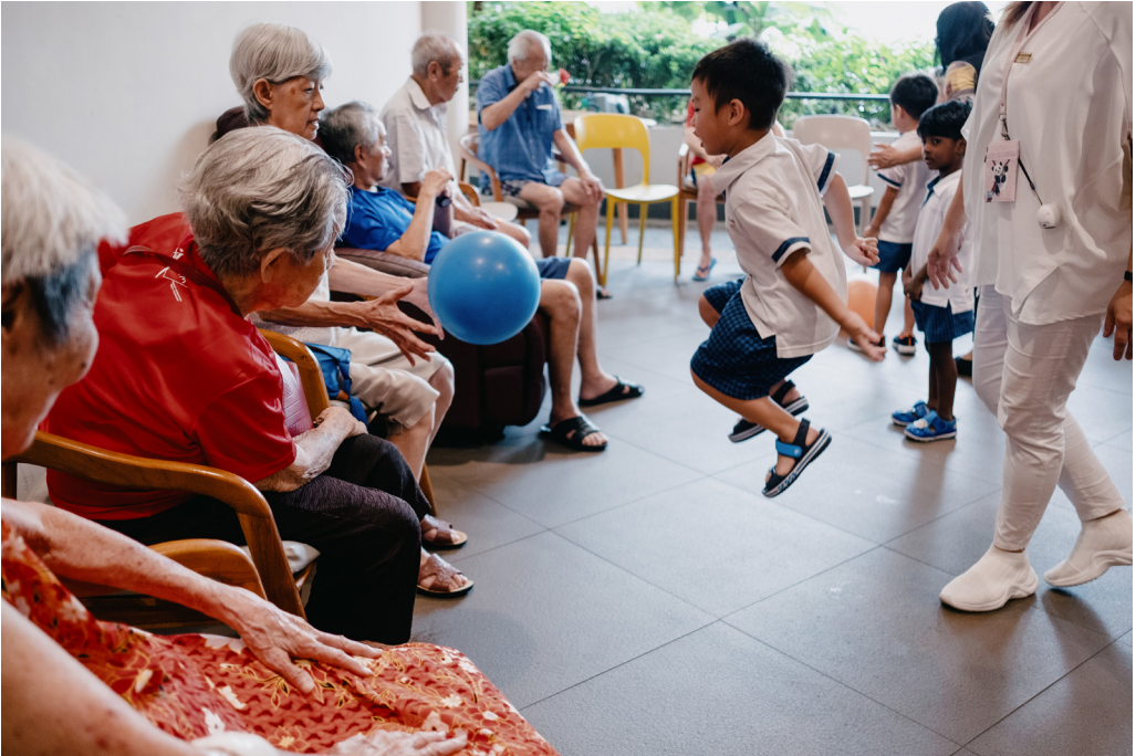
A daily gathering of residents and nursery school children at St. Joseph's Home.